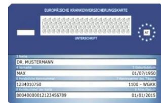
European Health Insurance Card

EU-students are normally sufficiently covered by their national insurance plan. Please submit a copy of your European Health Insurance Card (front and back page) valid for your entire exchange at EBS.